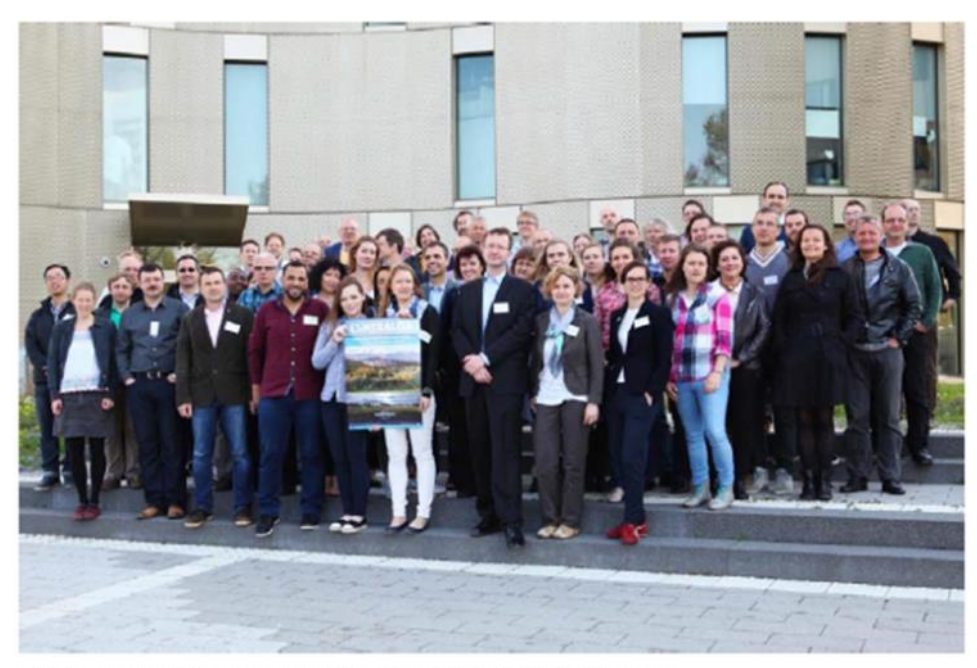
IMAGE: THIS IMAGE SHOWS THE ESMERALDA CONSORTIUM GROUP PHOTO, view more >

Humankind benefits in multitude ways from biodiversity, ecosystems and the services they provide. Such services include for example the provisioning of drinking water, food security, air quality regulation or recreation.