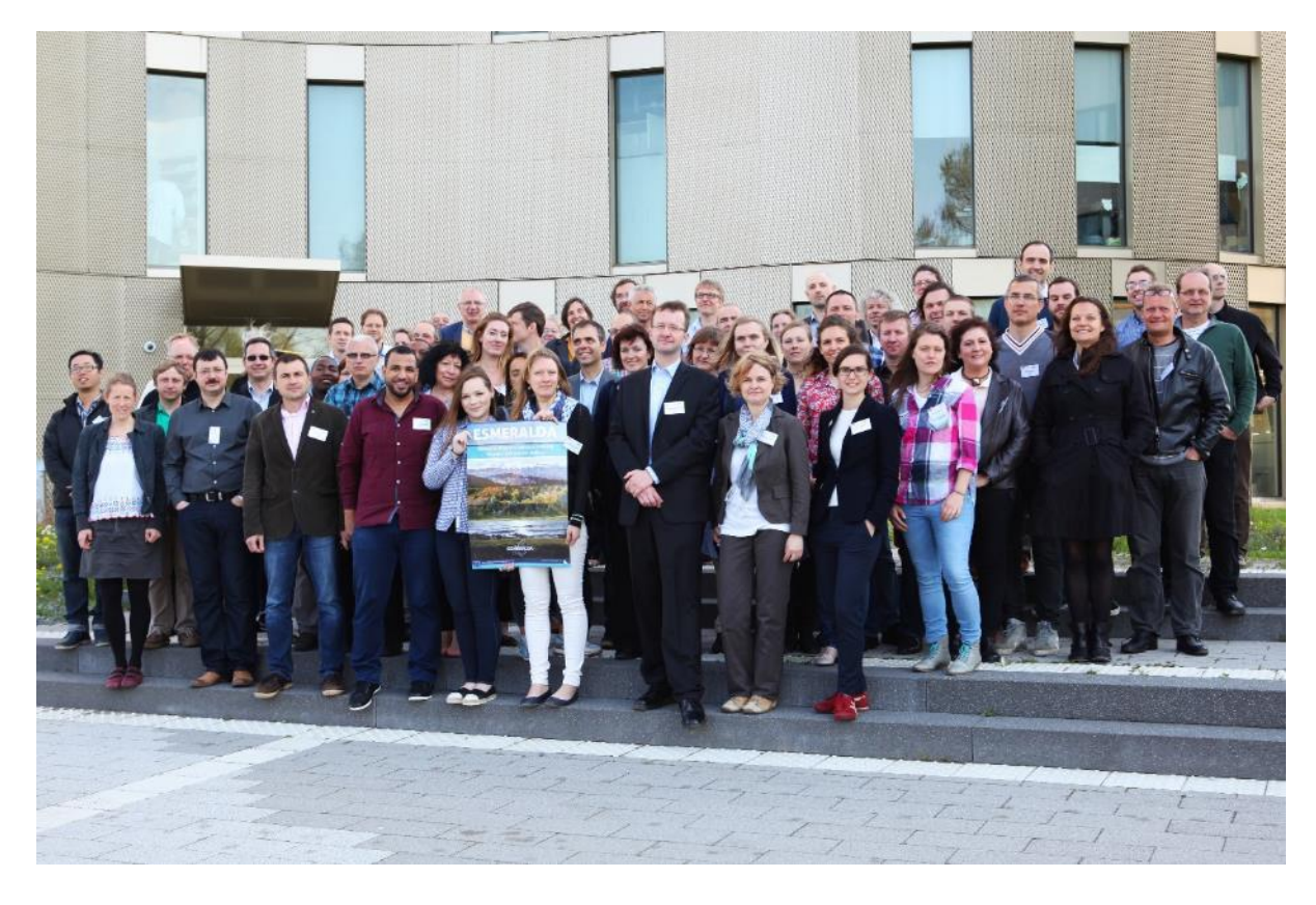
Figure 1: Group Photo on Workshop day 1.

This Milestone report gives an overview of the event and includes the protocols from the different breakout sessions. The breakout sessions aimed at fine-tuning the work in WPs 2-5, distribute tasks and develop the working plans for the first 18 months of the project. More information, all given presentations as well as further pictures can be downloaded from the Project's Internal Communication Platform at: <a href="http://esmeralda-project.eu">http://esmeralda-project.eu</a>.